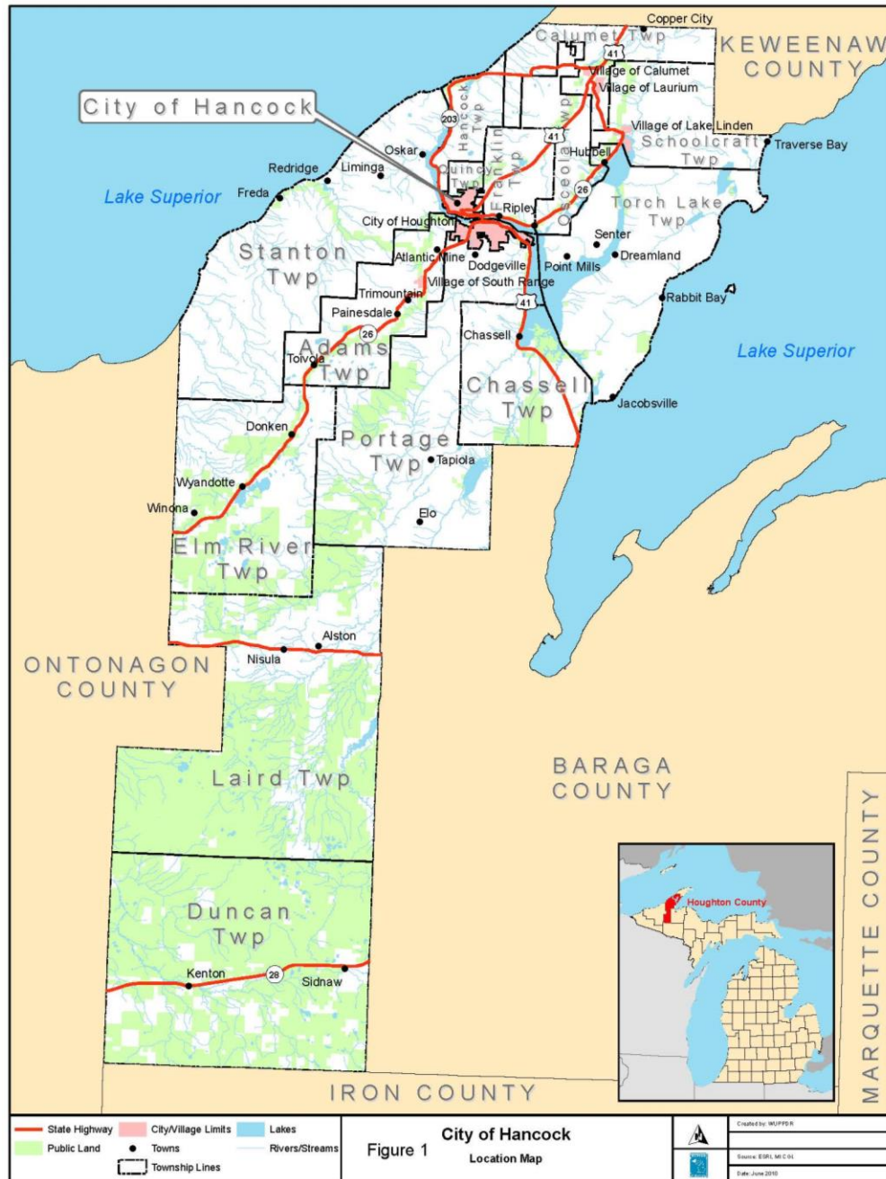
Figure 1: City of Hancock Location Map

Population information from the 2010 Census is provided in the following table.