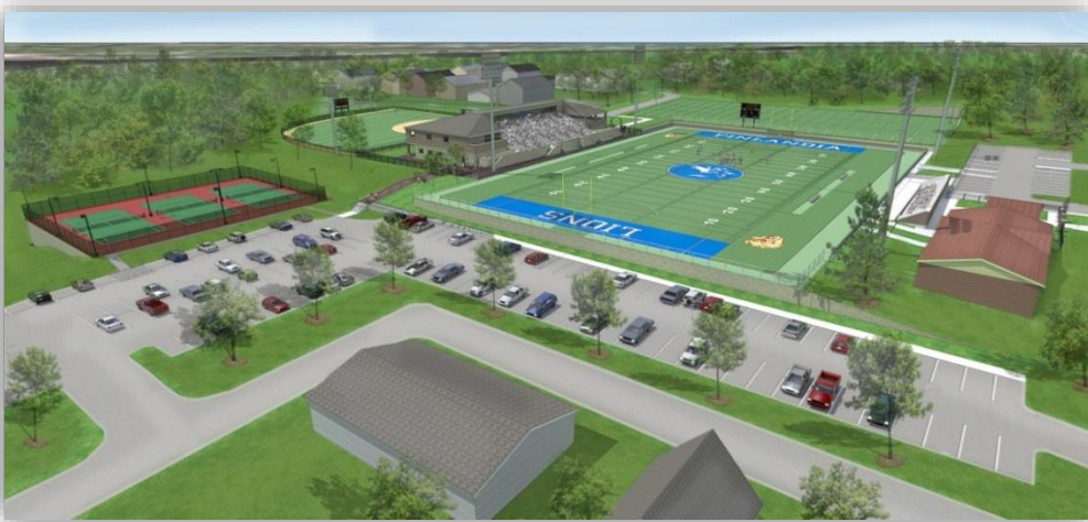
Figure 5: Finlandia University Outdoor Sports Complex (artist's rendering)

6. McAfee Field & Complex –McAfee Field (formerly Condon Field), refurbished in 2011, is home to the Finlandia University soccer teams (men's and women's) and NCAA Division III men's football program, which began competition in 2015. It also hosts the Hancock Central High School varsity and JV football teams. The complex now features an 11.4-acre park with lighted Pro Grass artificial turf playing surface and a state-of-the-art Daktronics LED video scoreboard. Finlandia redesigned and is renovating the entire site, which will include a competition football and soccer field, an Indoor Training Complex, a new grandstand and locker rooms, softball diamond with lighting, nature trail, and alumni pavilion. Figures 5-6 show plans and photos of the new facilities. Accessibility assessment = 3.