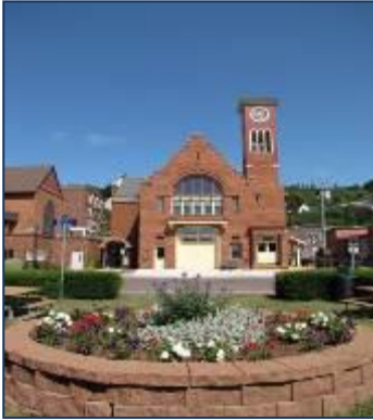
City Hall & Police Department