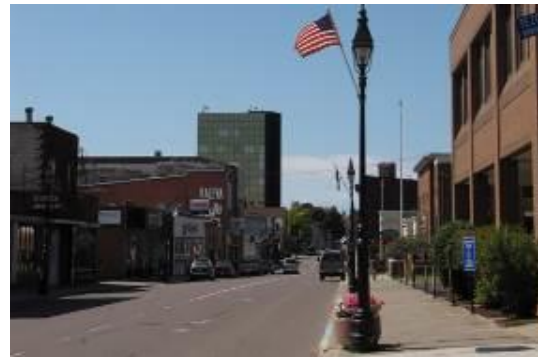
Beautiful downtown Hancock on a clear day.